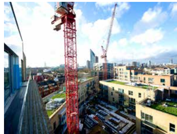
Top image: the site of Elephant Park Bottom image: Trafalgar Place