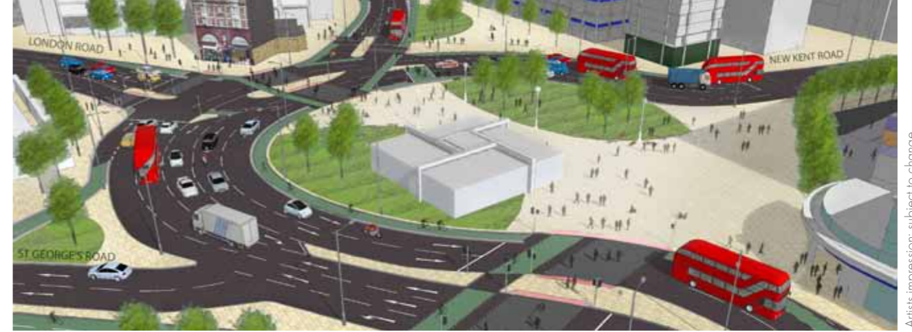
Artists impression: subject to change

“It may well do” says Aaronovitch. “I never know”.