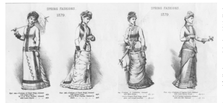
From top left: Elephant and Castle c. 1960, Elephant and Castle Theatre c. 1930, Elephant and Castle c. 1907, Dunn and Co programme, Newington Causeway c. 1860 and Tain Springs fashions.