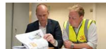
One The Elephant electrics contractor Wingate Electrical has been a Southwark employer since 1995 and recruit and train apprentices locally.

So far, more than £2.7m worth of regeneration works contracts have been awarded to local businesses by Lend Lease. To register your interest as a supplier or consultant, email residentialsupplychain@lendlease.com .